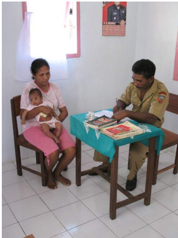
12b: One of the first patients is seen in the clinic by the mantri [‘nurse practitioner’].

In return, heads of neighboring villages set aside a 350-acre Heritage Site in the Seram forest, to be protected from human intervention. We have also aided schools in Seram and West Papua with much-needed school desks, chairs, uniforms and books. A pamphlet teaching basic principles of cleanliness and good health was developed and distributed. These are just a few of the “in-kind” donations which can be given to improve the quality of life, and perhaps as importantly, to help built their trust in a foreign NGO —the sina qua non of such Programs.