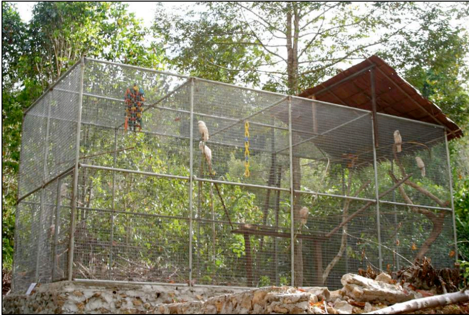
Figure 3b: Photo of one of several current cages for Seram cockatoos, Kembali Bebas, dimensions of 9x4x3 meters.