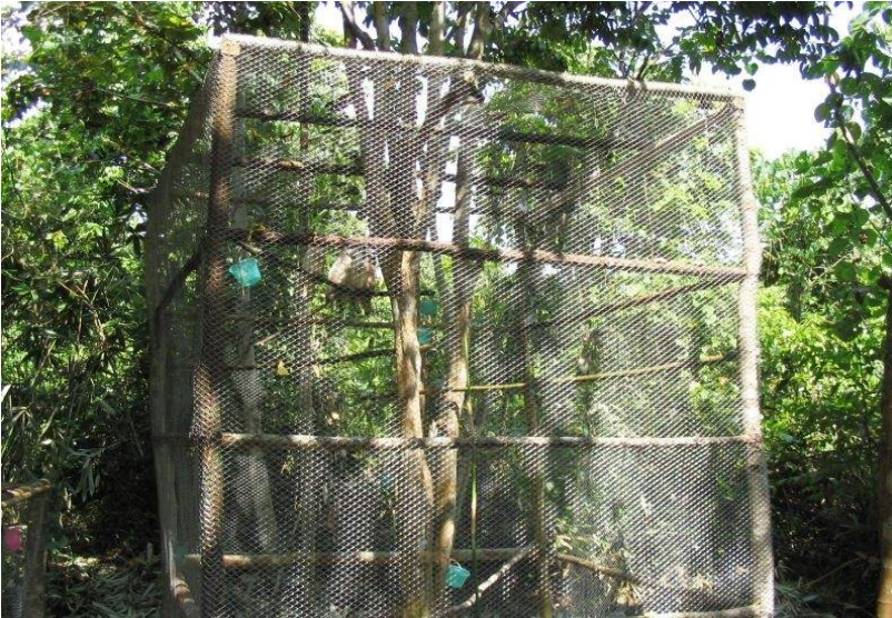
Figure 3a: First cage built for KB, made using available wood and wire. It was constructed literally overnight under emergency conditions, when the first parrots and cockatoos were suddenly turned over to IPP for care and rehabilitation. This was the literally overnight inception of KB.