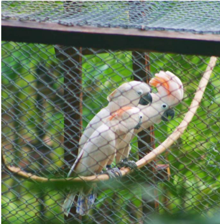
Figure 8a: Three cockatoos just prior the first release. Note the coloring places on the tail feathers for visual identification , as well as the presence of leg bands for identification.