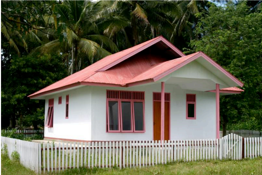
Figure 12a: One of two medical clinics built for the villagers by IPP.