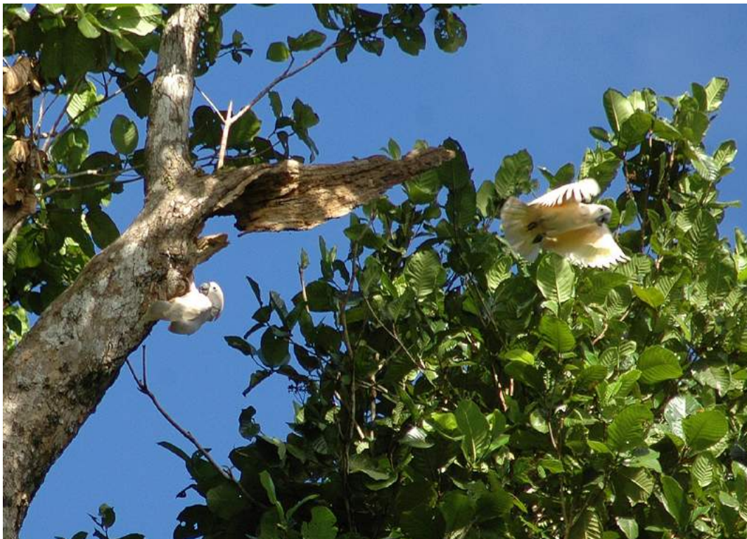
Figure 11c: Mated cockatoos search for suitable nesthole. At least one of the pair had previously been rehabilitated and released from KB.