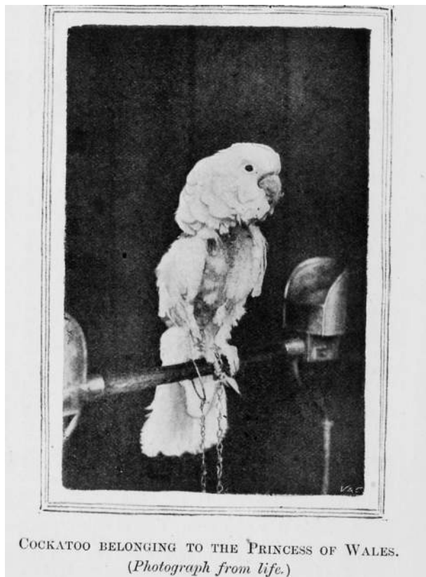
Figure 5b: Possibly the first photograph of a Seram cockatoo with severe FDB and Self-Mutilation Syndrome. See text for details.

It is easy, on superficial examination, to confuse Pbfd with Feather Destructive behavior.. A few cockatoos, who had been transferred to us from the Bali Wildlife Rescue Center, had and continue to have Feather Destructive Behavior [FDB] and self-mutilation. Interestingly, FDB may have first been described around 1764 when macaws and cockatoos "shrieked or pulled out their feathers when unwillingly restrained " [Robbins, p10 &134]. FDB and Self-Mutilation Syndrome "blossomed" by the end of the 19 th C., a time line matching that of shift from aristocrats who kept their birds in large flight aviaries, to the commoners. Butler (1910) includes, without comment, a black and white photograph of a cockatoo-- obviously a Salmon-crested cockatoo-- belonging to the Princess of Wales at the end of the 19 th C., "which was severely feather-plucked.. [Figure 5b]