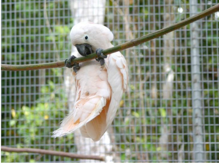
Figure 4: A Seram cockatoo plays on a long perch made of natural materials.