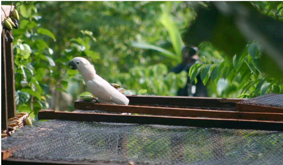
Figure 8b: The first cockatoo released from KB. From the first release (date: March, 2006)