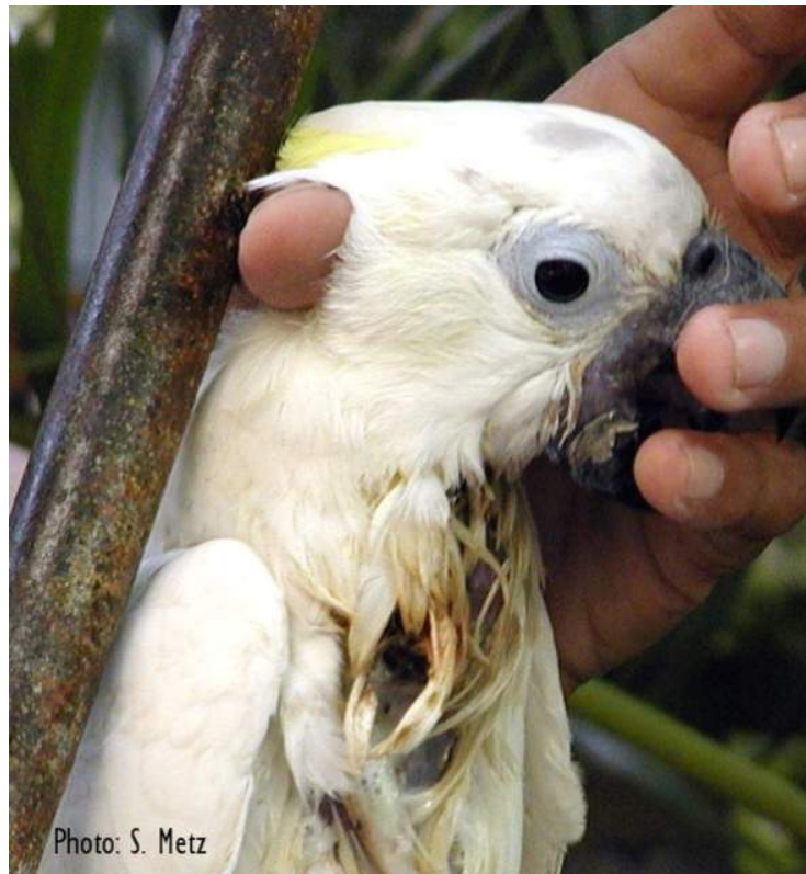
Figure 10a Cockatoo with hole in his crop.