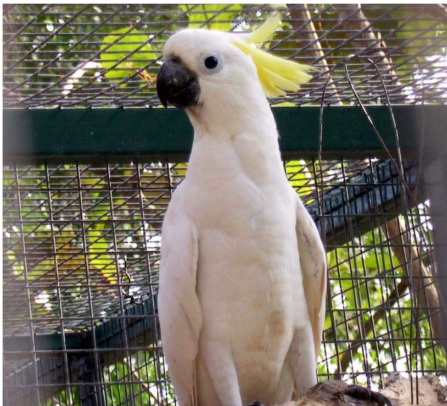
Figure 10b Same cockatoo following rehabilitation.