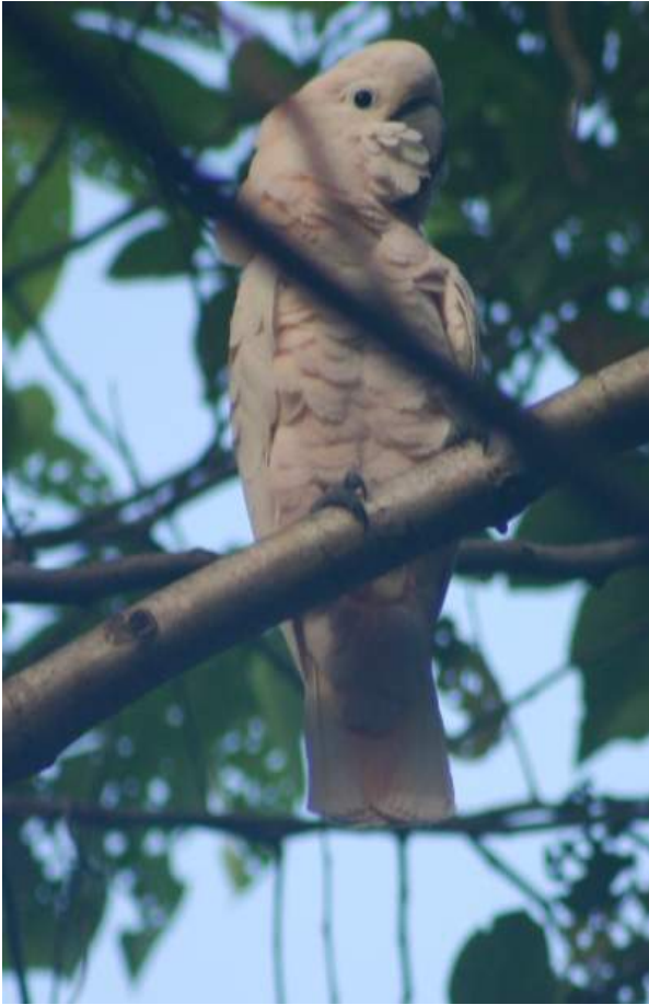
Figure 9: An “escapee” peers down at his caged fellow cockatoos. This escape occurred very early in the history of KB.

However, it is even critical to note that, prior to the initiation of the Kembali Bebas , the Government Authorities took all confiscated parrots and set them free, not only via ‘hard-release’, but all or almost all, on Ambon Island, not Seram [Personal Communication to S. Metz and B. Zimmermann from Officers of the Office of Conservation and Natural Resources, Ambon]. This practice continues, albeit on a smaller scale, even today, after IPP ceased its management of KB. Such releases could cause genetic pollution, since at least some of these parrots of these birds probably never existed naturally