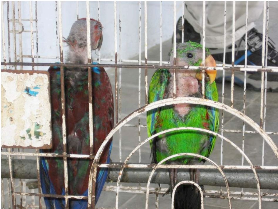
Figure 10c This pair of Eclectus was found in 2006 at the Government Conservation Office in Ambon. Their poor health is evidence, as is the rusted, inadequate cage, [which was left on the ground near dogs] of the appallingly bad treatment.