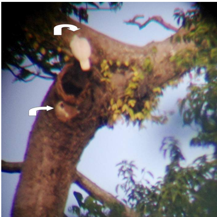
Figure 11a:

Fledgling peers from nesthole [ lower arrow ] as parent [ upper arrow ] gazes towards it. Photo is both grainy and blurred since it was taken through both the camera lens and a telescope from a long distance, so as not to disturb the new fledgling.