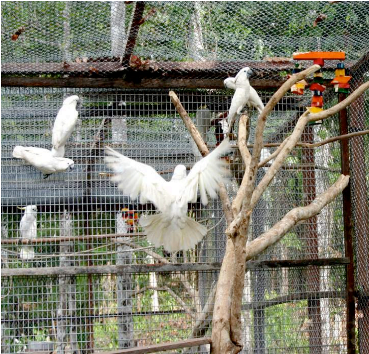
Figure 3c: Photo of cages for Cacatua alba and C. sulphurea , Kembali Bebas.