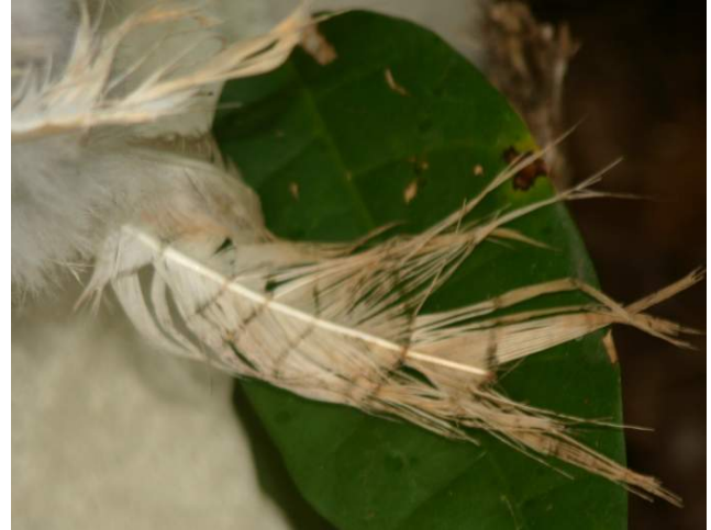
Figure 7a & b: Severe malnutrition in a young Seram cockatoo, as evidenced by a protruding keel and “stress feathers” on his tail [7b]. We were able to resuscitate him briefly but could not sustain this. At gross necropsy, his proventriculus was filled with wood chips and his crop was filled with a “cheesy” material, presumably Candida. This was probably the lowest point for the Authors in the Seram Program