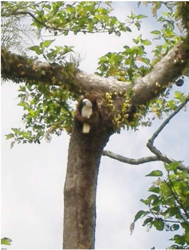
Figure 11b: Same site as #11a except that fledgling is not in the nesthole. A parent is seen guarding the nesthole. Both Photos (11a and b) by staff at KB