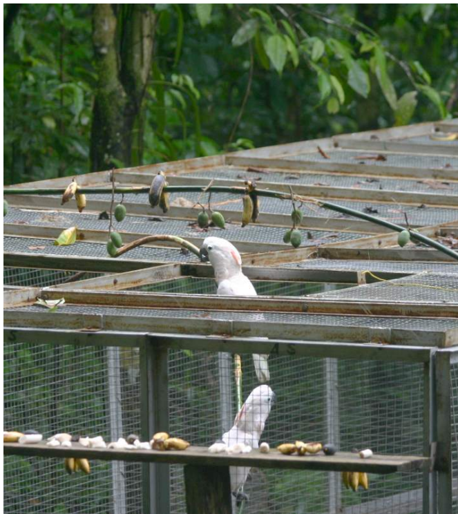
Figure 8c: Two Seram cockatoos contemplate their release back into the forest. From the second release in which a total of seven cockatoos and 4 Purple-naped lorries were released.